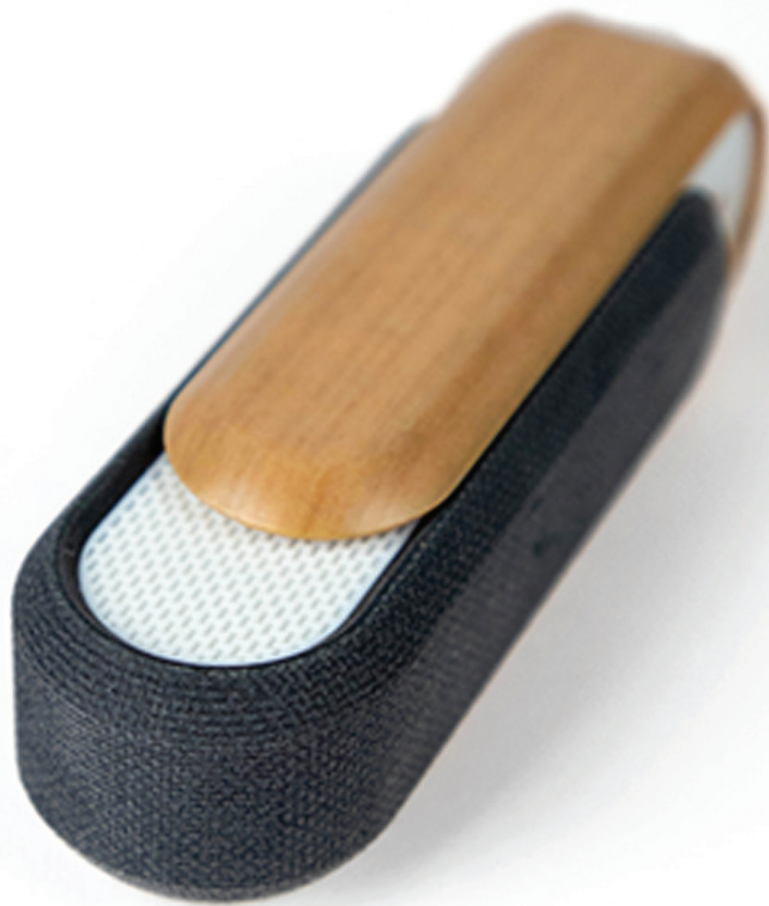
Speaker prototype 3D printed on the J55 Prime