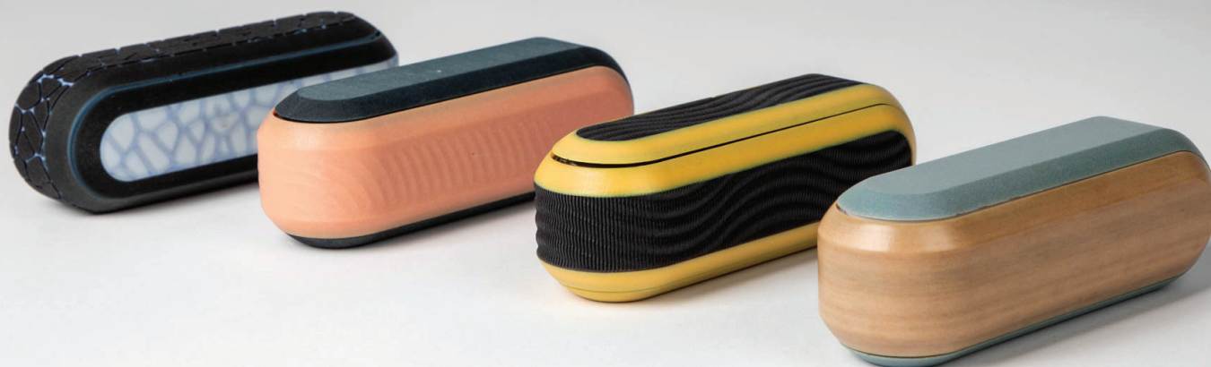
Early CMF explorations 3D printed on the J55 Prime

This workflow has major implications for how the team will approach future projects. Priority Designs uses KeyShot throughout the product design process – it offers a large material library and the renders help communicate ideas to clients. The ability to go from KeyShot render to 3D print with few steps in between saves time and makes it easier to create physical prototypes.