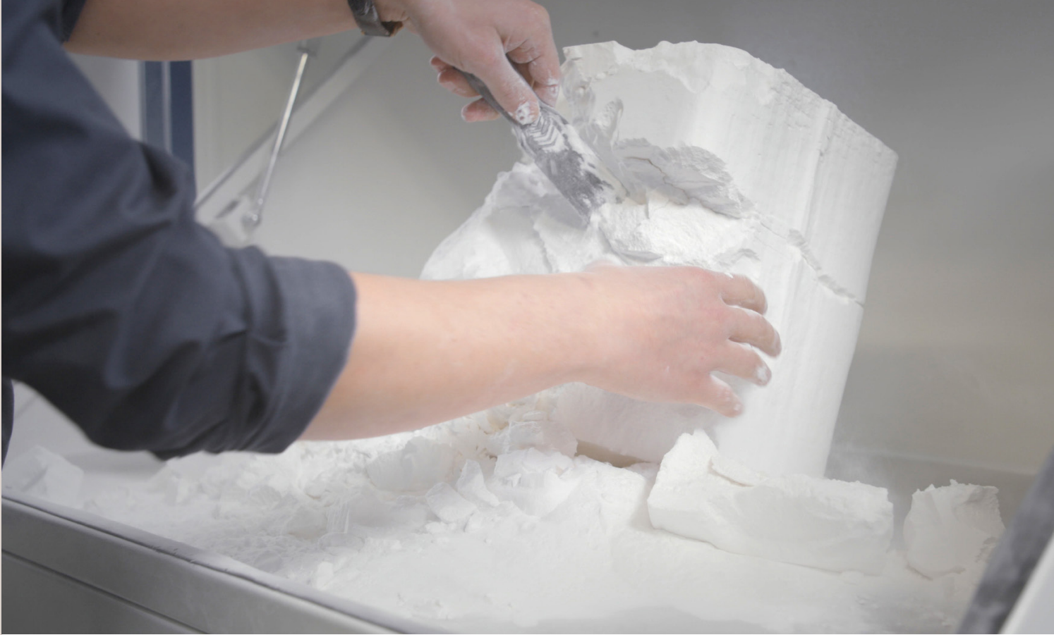
The H350 uses an infrared sensitive HAF™ to fuse particles of polymer powder together in layers to build parts

However, when it comes to producing volumes of up to several thousand parts, Goetz has been reliant upon traditional manufacturing methods like injection molding. While part quality is great, this has come at a cost to the business with mold production extremely costly and time-intensive.