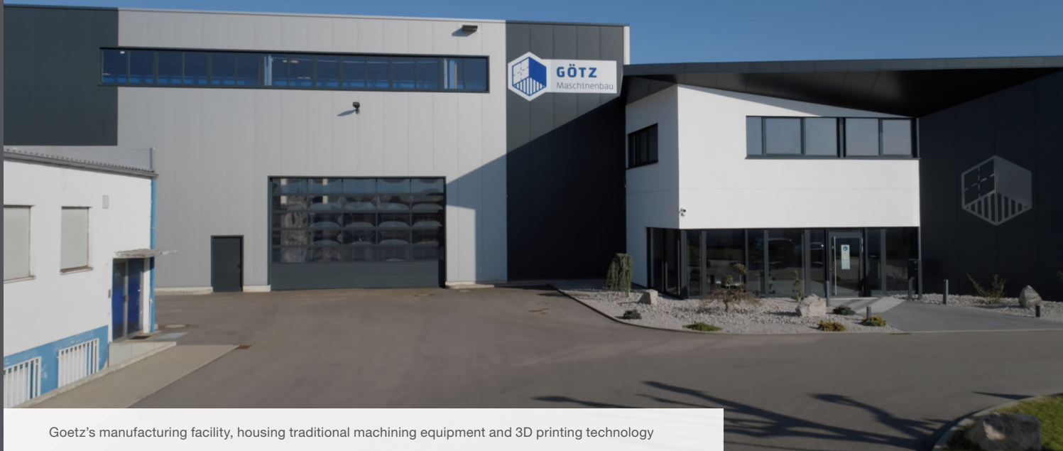
Goetz's manufacturing facility, housing traditional machining equipment and 3D printing technology