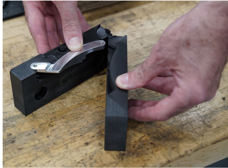
3D printed soft jaw tooling can be produced overnight, ready for use the next day.

Another application includes 3D printed surrogate parts. Some sub-assemblies East/West makes must fit with parts located off-site at the customer’s facility. Vetter’s team 3D prints stand-ins for those mating parts using customer-supplied CAD data. This ensures East/West’s parts fit perfectly with the customer’s assembly. “First-time quality is critical to our customers. Being able to inspect the parts to ensure they’re going to work 100% when they go out the door is a huge benefit for our customers and East/West,” says Vetter. It also shows customers how East/West invests in forward-leaning technology like additive manufacturing to meet their needs.